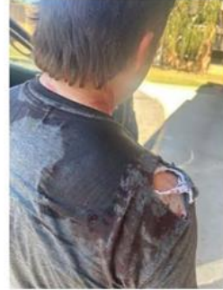
Pictures of a resident of Cardston County who was fishing on the St. Mary's River