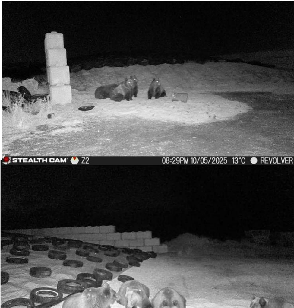
Below, Bear within a farmyard in the hamlet of Kimball