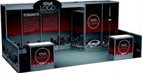
Model 5 - 10' x 20'