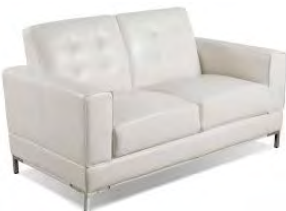
Leather Love Seat - 2 Seater