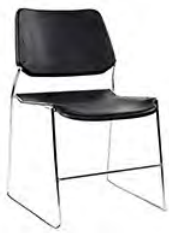
Plastic Contour Chair