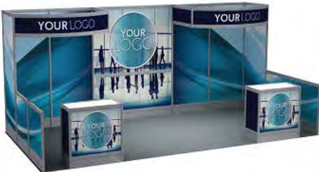
Model 4 - 10' x 20'