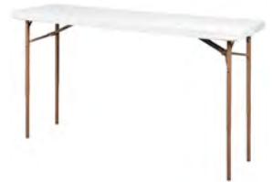
Unskirted Counter - 42" High 4ft., 6ft.