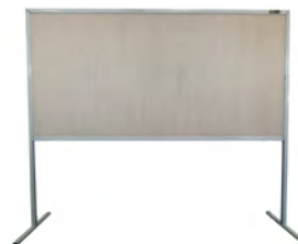
4' x 8' Posterboard

Colors may vary due to facility lighting, printing limitations and dye lot differences. Some items may not be available at all locations. See order form for details. Styles of items portrayed on this brochure may vary in some locations.