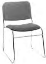
Grey Fabric Side Chair