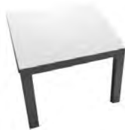
End Table - Square