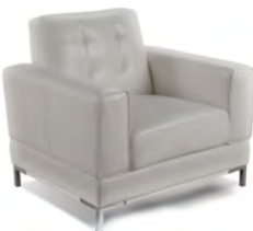
Leather Club Chair - 1 Seat