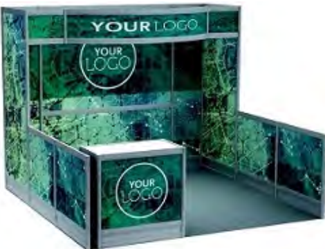
Model 1 - 10' x 10'