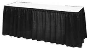
Skirted Table - 30" High 4ft., 6ft., 8ft.