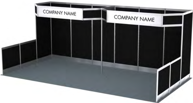
Package B - 10' x 20'