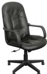
Executive High Back Leather Chair