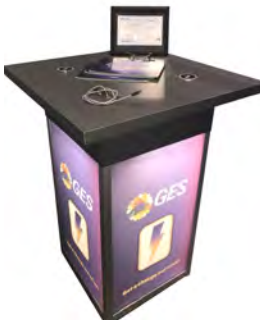
Cocktail Charging Station with Backlit Graphics

Colors may vary due to facility lighting, printing limitations and dye lot differences. Some items may not be available at all locations. See order form for details. Styles of items portrayed on this brochure may vary in some locations.