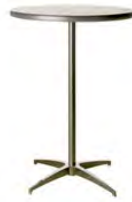
Starbase Table - 40" h (cocktail table)