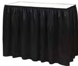
Skirted Counter - 42" High 4ft., 6ft.