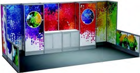
Model 6 - 10' x 20'

Colors may vary due to facility lighting, printing limitations and dye lot differences. Some items may not be available at all locations. See order form for details. Styles of items portrayed on this brochure may vary in some locations.