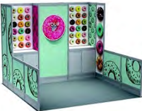
Model 3 - 10' x 10'