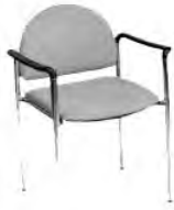
Grey Fabric Arm Chair