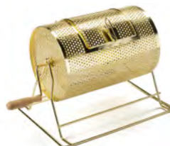
Small Ballot Drum