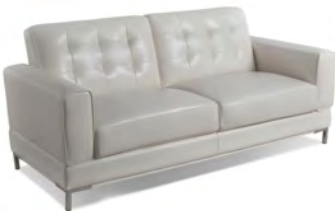
Leather Sofa - 3 Seater