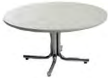
Starbase Table - 18" h (coffee table)