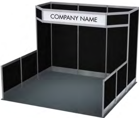
Package A - 10' x 10'