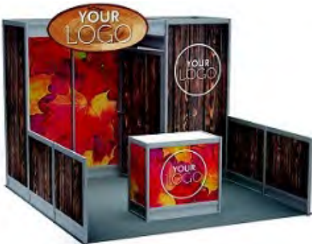
Model 2 - 10' x 10'