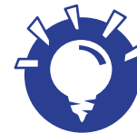
20 Year Renewal Investment Versus AALCI

This is a common approach to considering the amount that will need to be invested in assets over time. The sample chart below shows the renewal investment and AALCI for a town's asset.